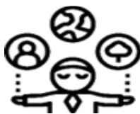
Stewardship & Responsibility