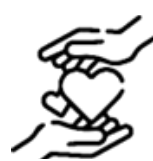
Justice & Mercy