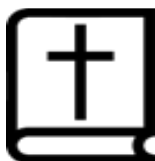
Honouring God & His Word