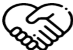
Respect: Others & Ourselves