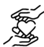
Justice & Mercy