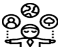
Stewardship & Responsibility