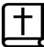
Honouring God & His Word