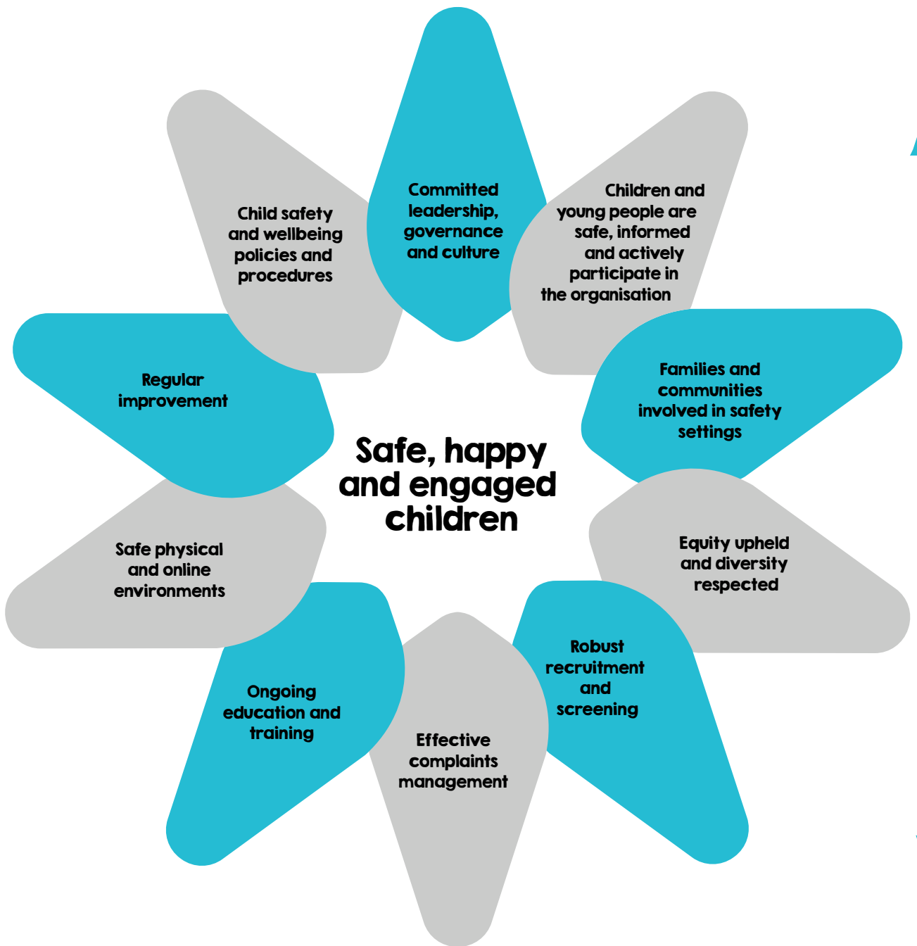
Wheel of Child Safety